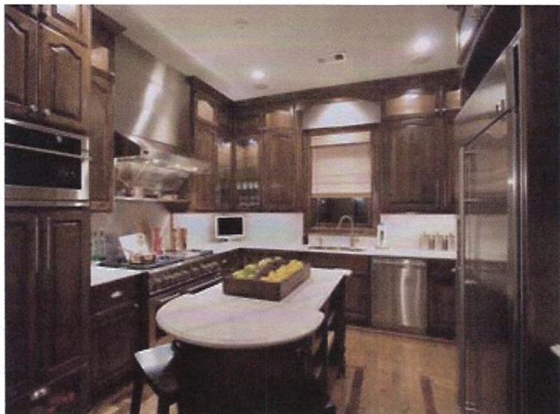
Professional cooktops, elegant marble countertops and rich wooden cabinets that extend to the ceiling, illustrate the reason this beautiful home is a recent award winner.

create an entire lifestyle for the home buyer, using extensive recreational amenities, appealing streetscapes, attractive landscaping and preserved natural features to increase the value