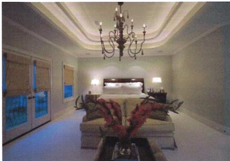
The master bedroom in this award-winning ZK Homes home is a magnificent retreat for the homeowner, beginning with the plush carpet and surround sound to help relaxation at the end of a long day. The recessed lighting with coffers and detailed ceiling pull the room together with a polished finish.